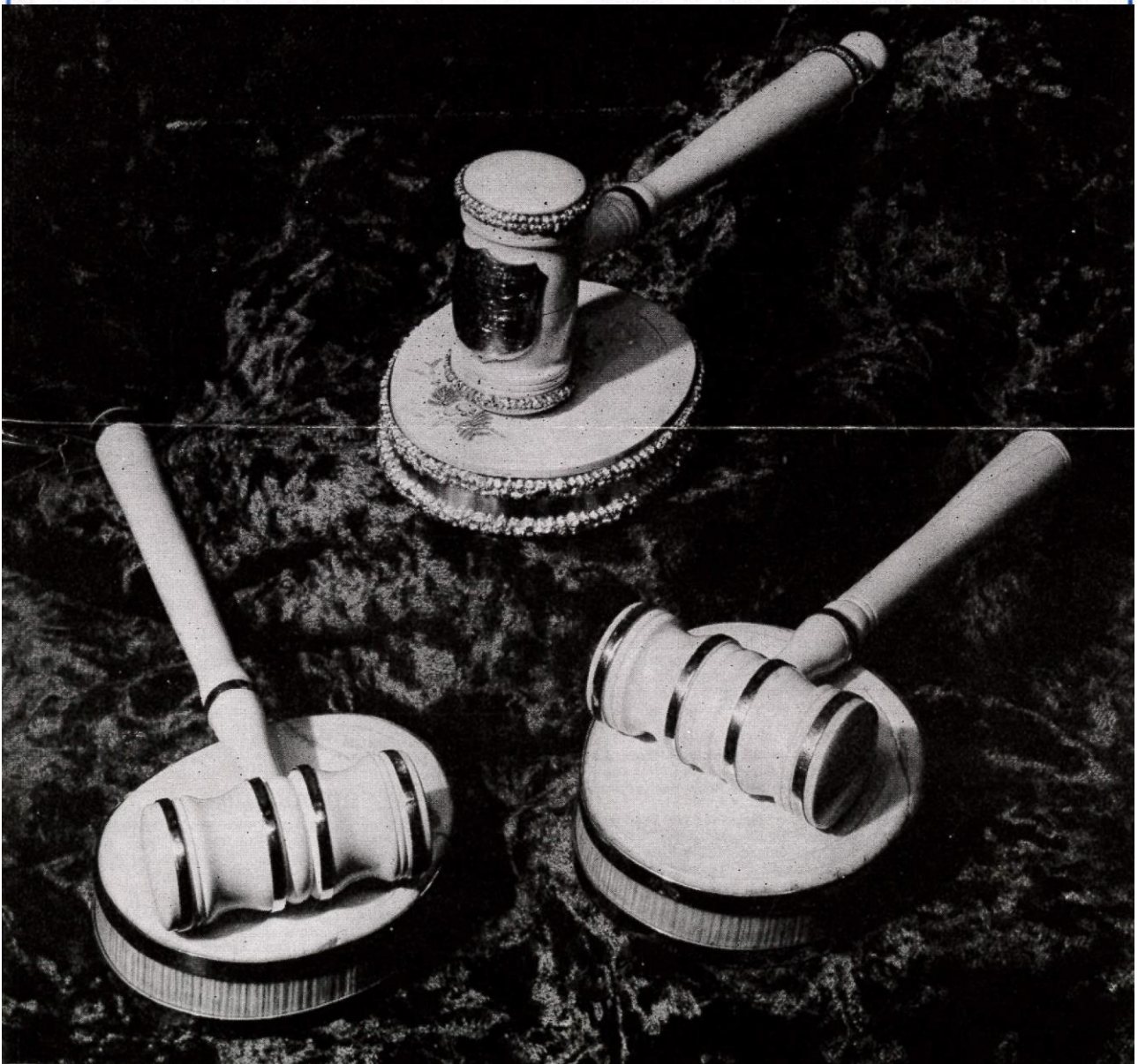
The Ivory Gavels of Grand Lodge