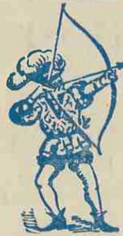
Aiming at Low Prices

50 Willis Street (Opposite Hotel Windsor) 'Phones 3263 and 1211.