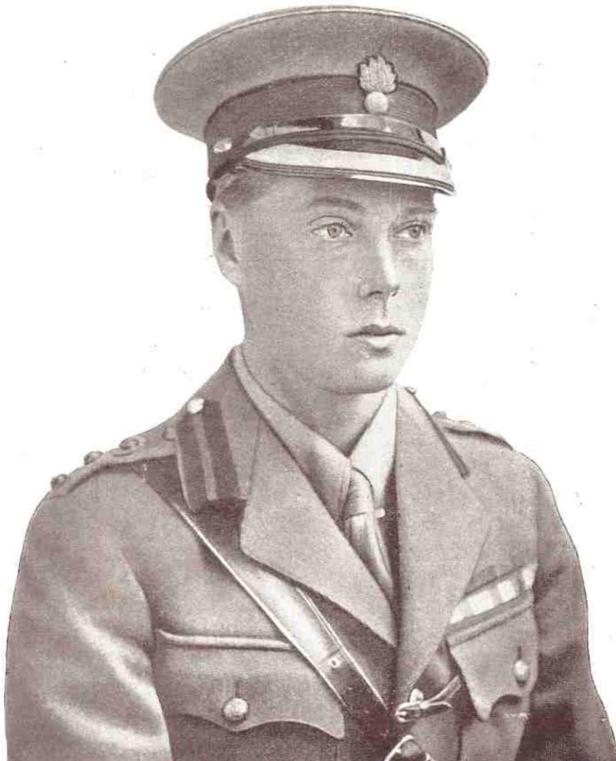
BRO. H.R.H. THE PRINCE OF WALES, K.G.

Supplement to "The New Zealand Craftsman"